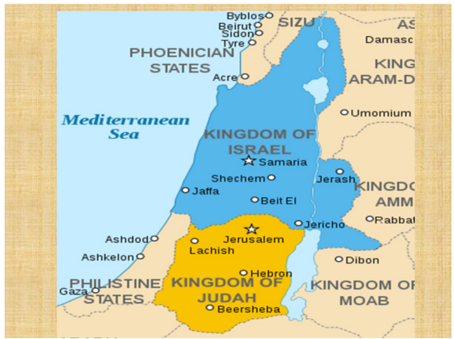
Maapu #4 Obugabe Obubaganisiibwemu