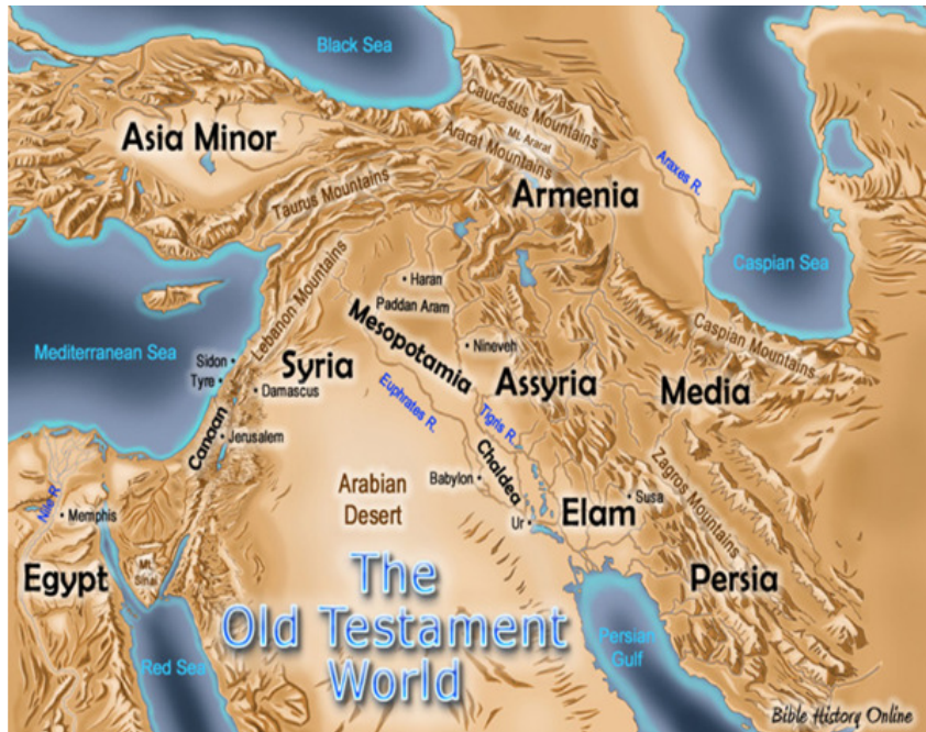
Maapu #1 Ensi y'Endagaano Enkuru