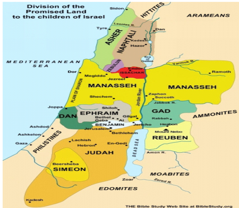
Maapu #2 Okuhangura n'Okutuura omunsi eyaraganisiibwe